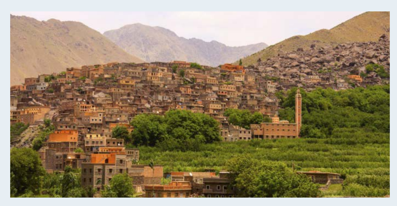
TANGER MED GROUP/MARSA MAROC DONATE 250 MILLION MAD TO THE SPECIAL FUND FOR MANAGING THE EFFECTS OF THE AL HAOUZ EARTHQUAKE